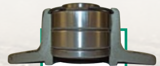
Heavy Duty Cast Hubs With 2 Triple Seal Bearings