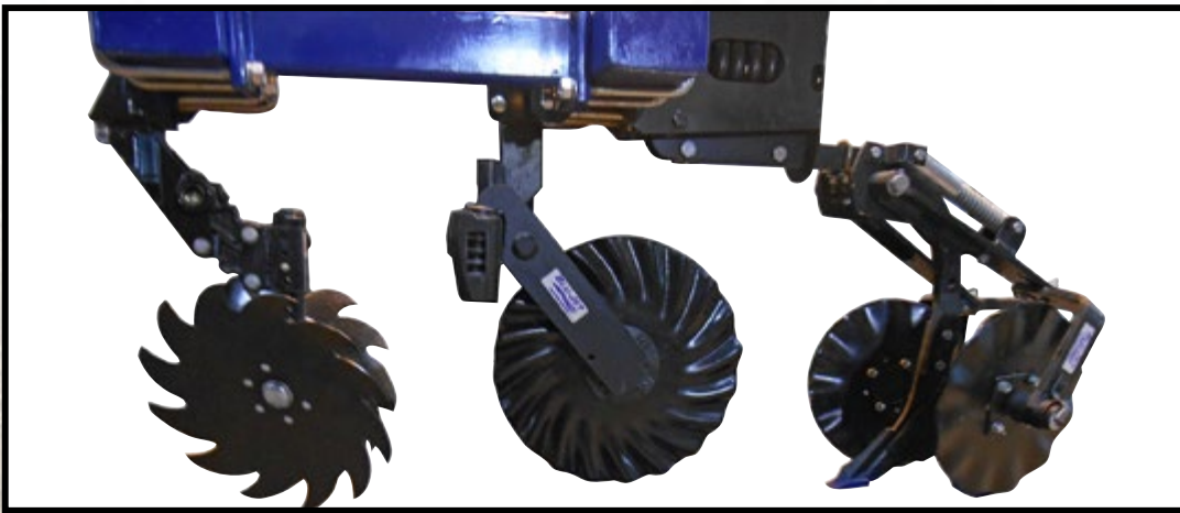
Available for Blu Jet Anhydrous and Strip Till toolbars

Now available with standard 13" discs or optional 18" discs